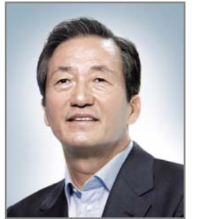
Dr. Chung Mong Joon

Dr. Chung received his B.A. in economics from Seoul National University, an M.S. from the Sloan School of Management at MIT, and a Ph.D. in international relations from the School of Advanced International Studies (SAIS) at the Johns Hopkins University.