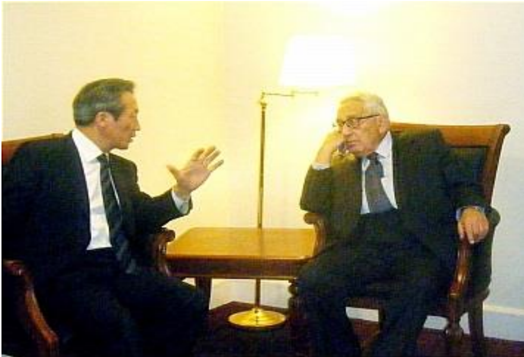
Image 2) In 2010, following an invitation from the Asan Institute for Policy Studies, a Memorial Lecture was held, during which Honorary Chairman M.J. Chung had a meeting with Secretary of State Kissinger.

Image 1) Honorary Chairman M.J. Chung, serving as the Chairman of the Special Committee on the Korea-U.S. Vision within the Grand National Party at the time in 2008, met with Dr. Kissinger at the Center for Strategic and International Studies (CSIS) during his visit to discuss issues regarding North Korea.