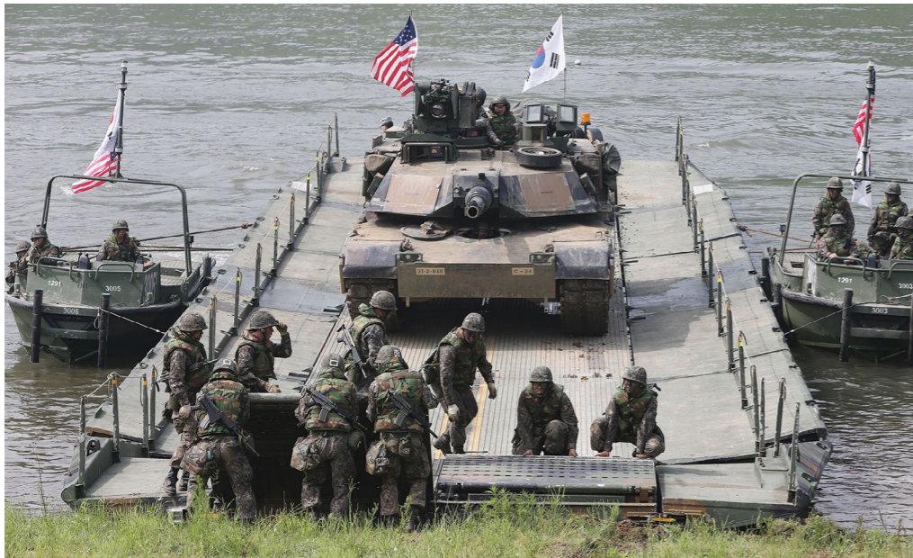
Figure 3. South Korea-U.S. joint military exercises

The main objective of the South Korean military is to deter an attack by North Korea. As mentioned, reducing North Korea's utility for Conflict , N_{DD+} , increases the denominator of N_2 . In turn, this reduces the overall value of N_2 . For a given South Korean credibility, P_S , there is a better chance of satisfying the existence conditions. There is more room for deterrence success. When North Korea's expected cost of conflict increases, N_{DD+} is reduced accordingly. Therefore, the status quo is likely to remain intact provided that initiating a conflict imposes high costs on North Korea. Undoubtedly, no weapon does better than nuclear weapons when it comes to 'imposing high costs on an adversary. In fact, North Korea, an illegal nuclear weapons holder, has done a much better job of reducing South Korea's utility for Conflict , S_{DD+} . The United States provides a nuclear