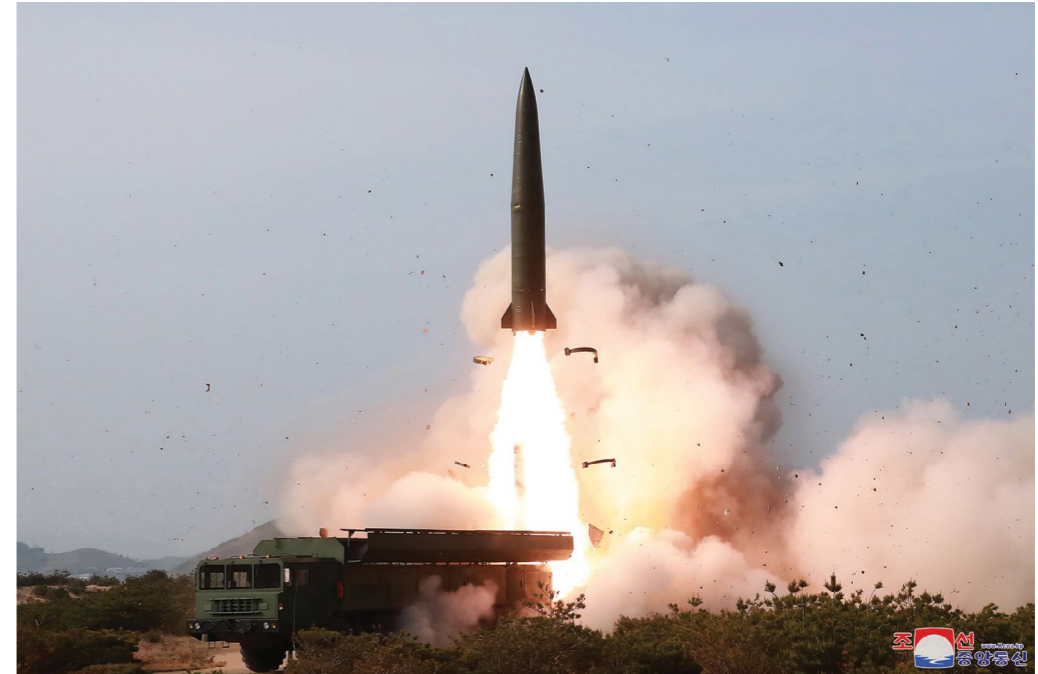
Figure 5. North Korea's KN-23 missile