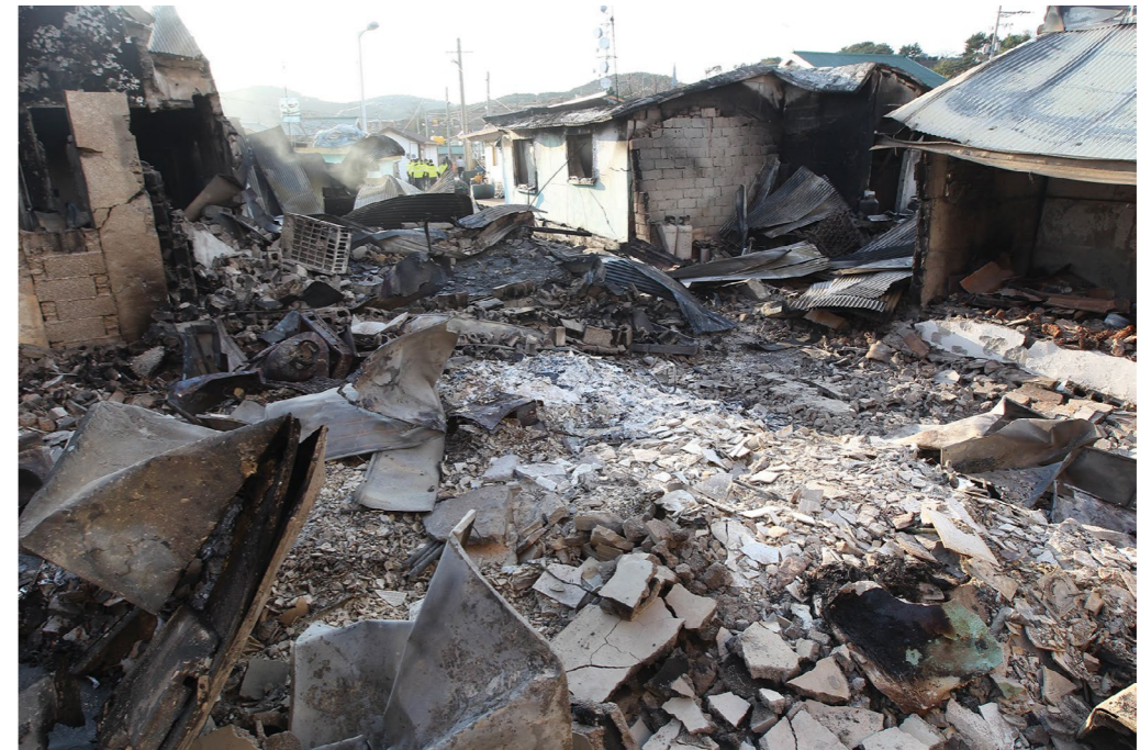
Figure 1. A burnt out house in the island of Yeonpyeong after the North Korean Shelling

Eight months later, North Korea fired around 170 artillery shells onto the small South Korean island of Yeonpyeong, killing 2 marines and 2 civilians and injuring scores more. The shelling damaged military infrastructure and started widespread fires on the island destroying houses and public buildings. The attack came in two waves catching the South Korean military off guard. It retaliated by firing back 80 artillery shells targeting the North Korean military. However, the South Korean military may have failed to deliver an immediate and ‘befitting’ response. Satellite photos released by STRATFOR cast doubt on effectiveness of its counter-attack on a North Korean multiple rocket launcher (MRL) battery contrary to the claims by JCS and NIS. 26 The